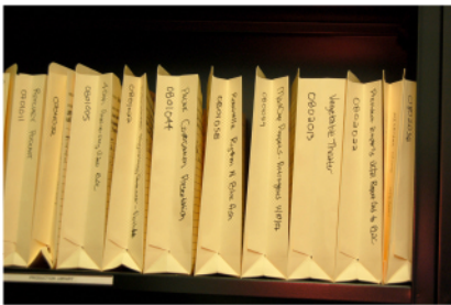
Production library – completed projects (detail)

Created production library, an organization system for storage of in progress materials Collects and stores project generated materials in the production library for completed projects