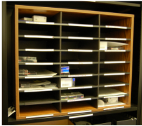
In progress project slots

Re-organized in progress production projects and recommended the purchases of several products to streamline, label, and organize the process