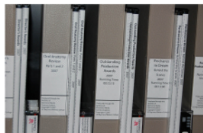
Vault masters (detail)