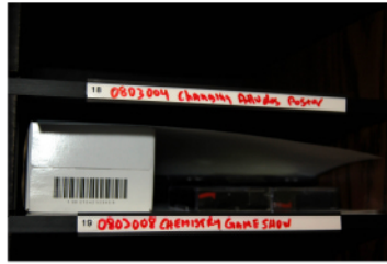
In progress project slots (detail)